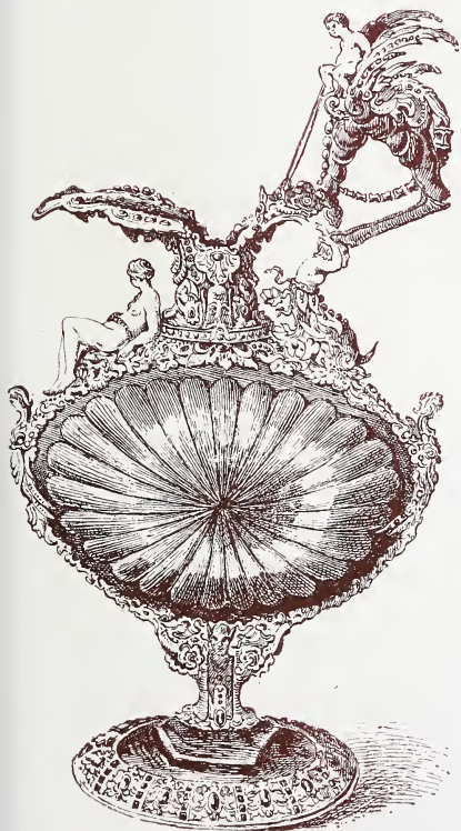
THE CELLINI EWER, MOUNTED IN ENAMELLED GOLD, AND SET WITH GEMS.